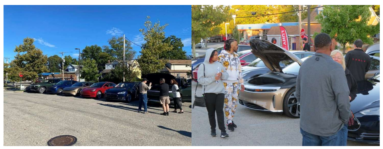
Above: EV Area 2 – Getting ready for giving rides. 2 Rivian R1T, Genesis, Model S, 3 & Y Anyone who took an EV ride – please fill out this post ride Survey: DriveThefutureEV.com/filedownloads