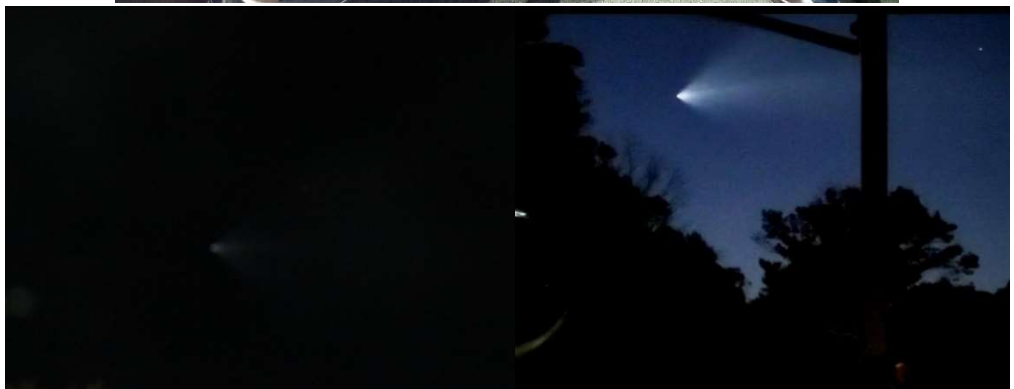
Above: Area 2 - ride & drives just as Space X launch 181 (43<sup>rd</sup> launch of 2022) carrying 52 Star Link Satellites does a fly by 6:41 pm

Bye the way, all communications from us have come to you via Space X - Star Link. Thanks again for helping make this the largest show we have ever done.